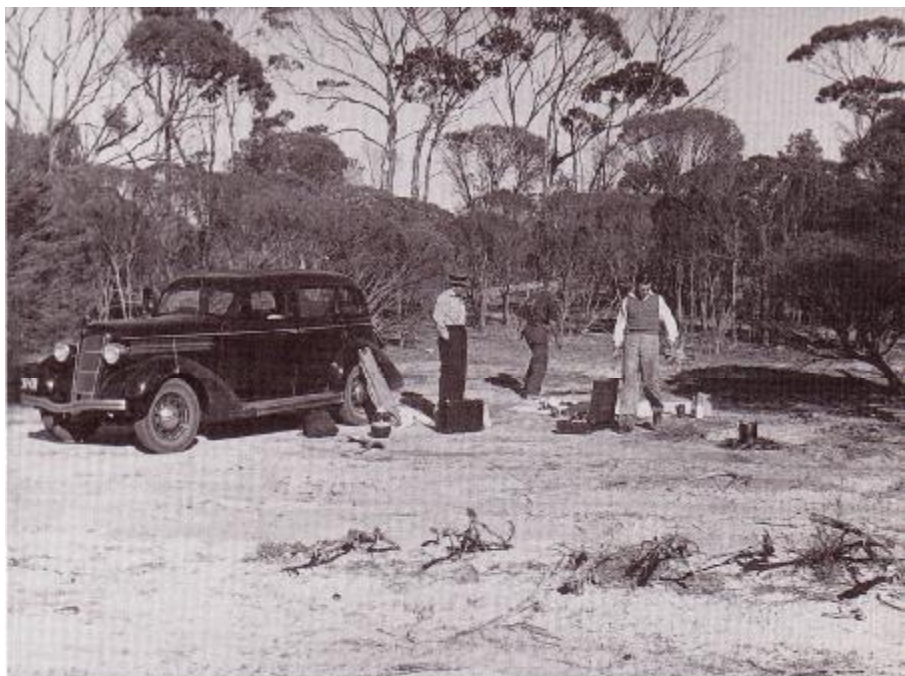
Above: Clearing the Karrinyup site, 1928-29.

Another working bee brought results which for one of us was just as poignant. One Sunday morning a few of us decided to remove the dead tree from the centre of the lake. The job had not been long in progress before a piercing cry of anguish echoed across the waters. No part of the human body is sacred to a leech. The exercise was completed but the injured party thereafter looked after the drinks.